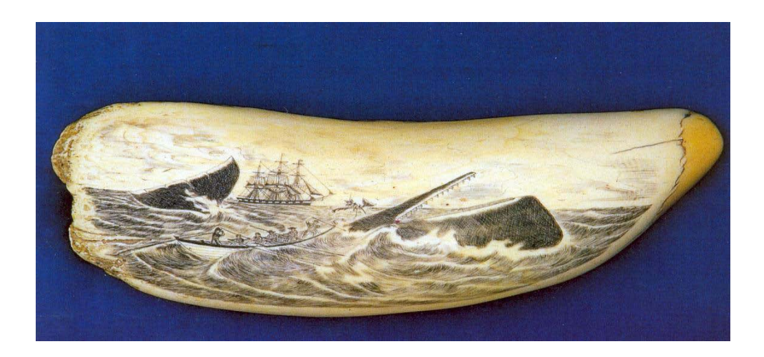
An Example of Scrimshaw