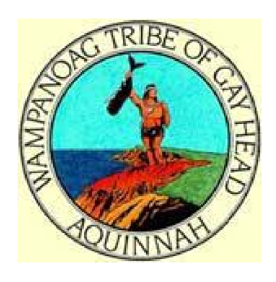
The Aquinnah Wampanoag Tribal Seal